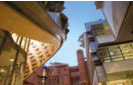
Masdar Institute of Science and Technology Leading research in the fields of advanced energy and sustainable technologies. Awarded British Expertise International Awards 2013